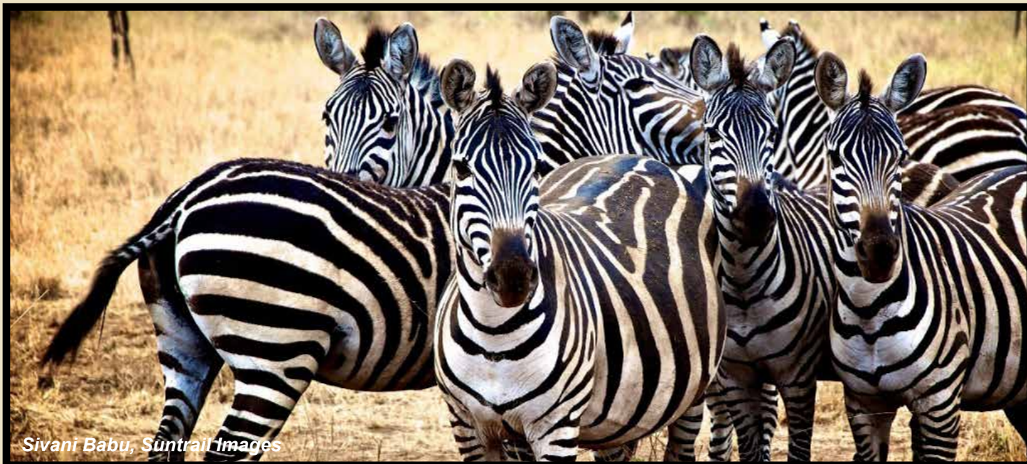
Sivani Babu, Suntrail Images